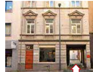
In the heart of area St. Jakob