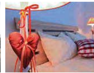
A bed with sense of security