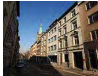
Guest apartments in courtyard location